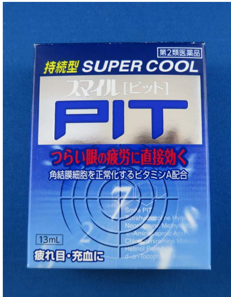
Front of box: Super Cool Pit - 13 ml - Labelled in English to contain Neostigmine Methylsulfate