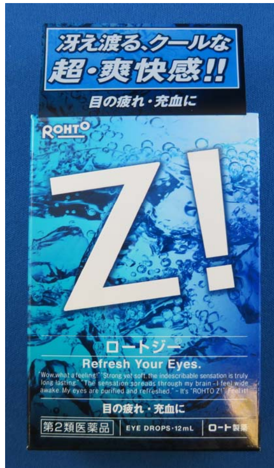
Front of box: Z! - 12 ml - Labelled in Japanese to contain Neostigmine