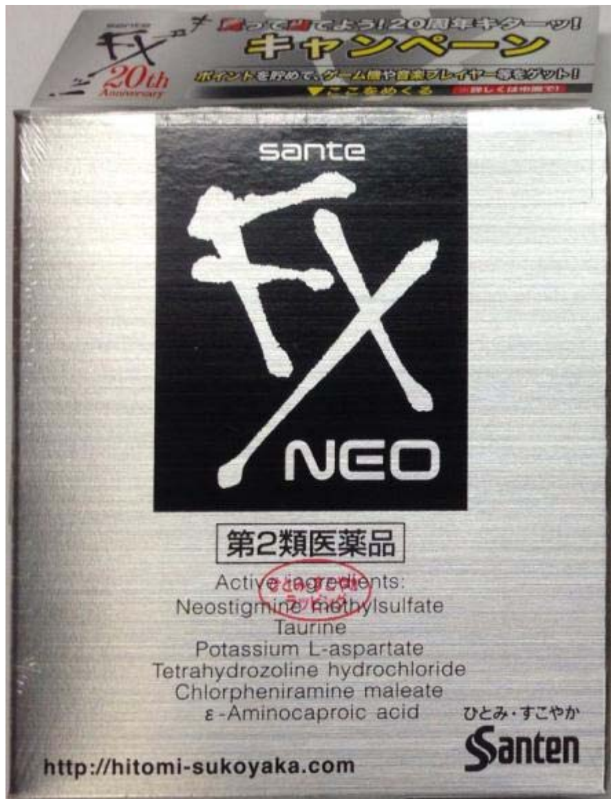
Front of box: Sante Neo FX - 12 ml - Labelled in English to contain Neostigmine Methylsulfate