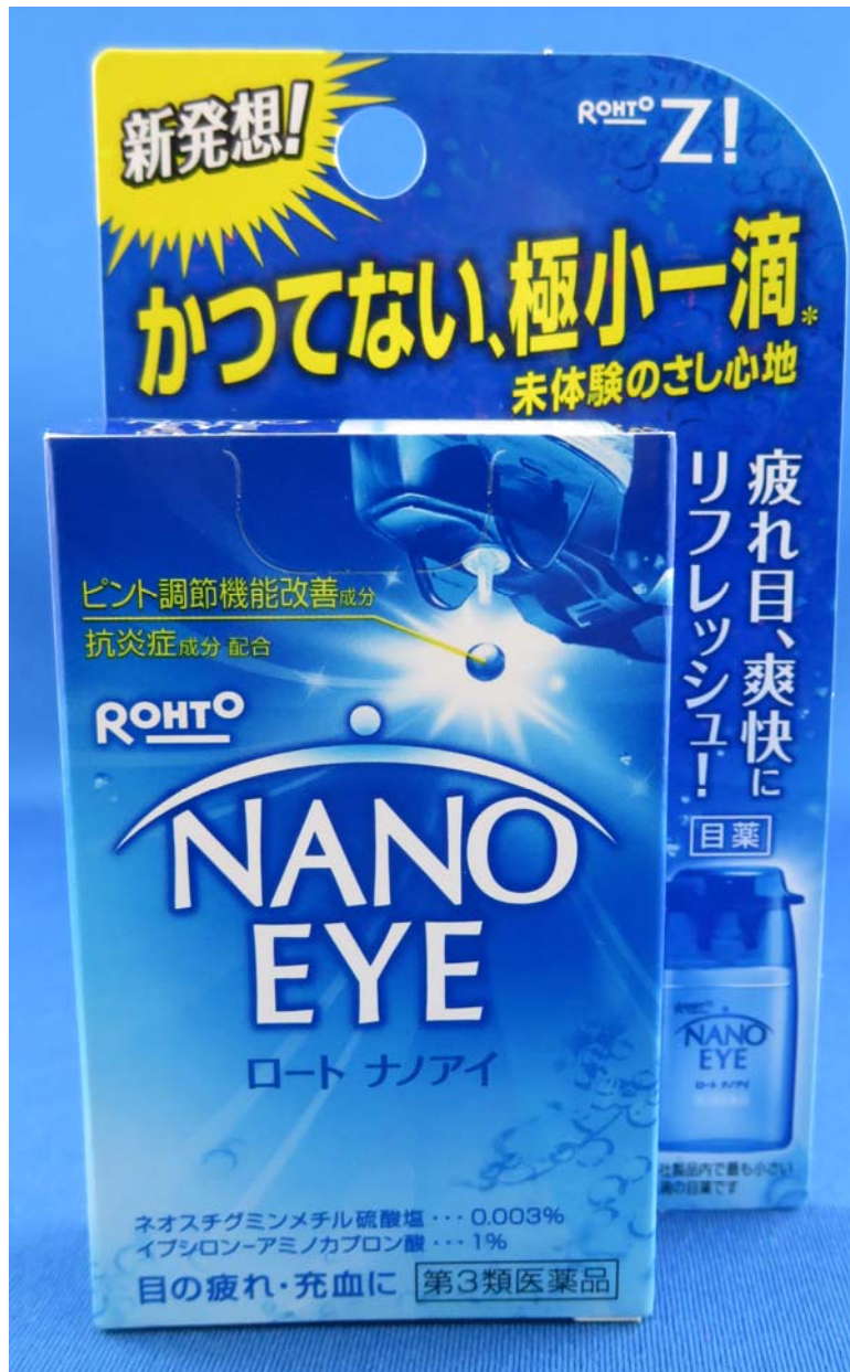
Front of box: Nano Eye - 6 ml - Labeled in Japanese to contain Neostigmine Methylsulfate 0.003%