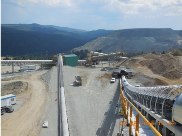
View from Secondary Crusher Building