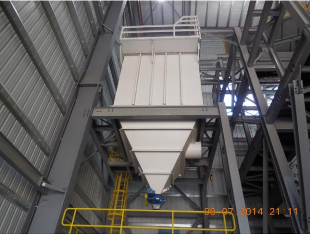
Installation of dust collector