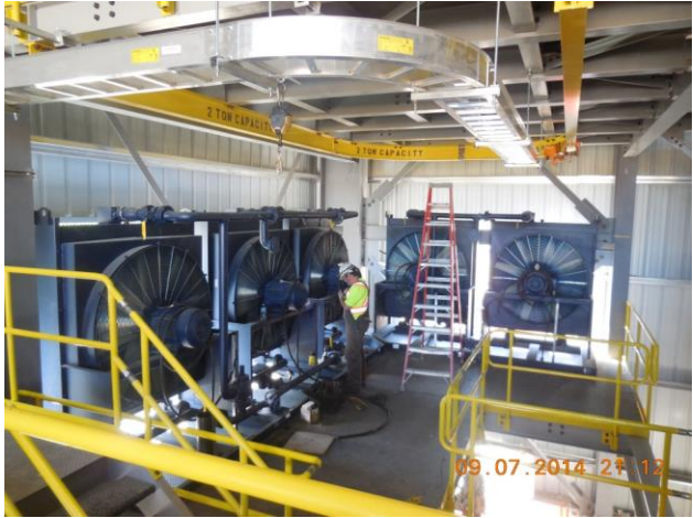
Installation of cooling fans