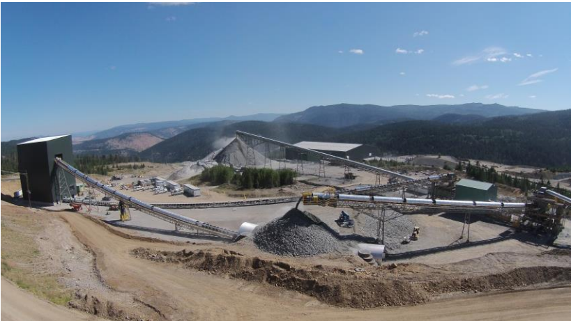
Secondary crusher in operation – Aug 6-2014