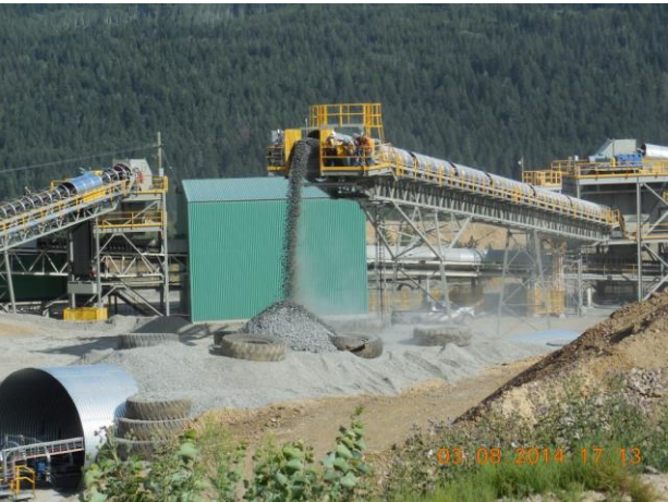
First ore coming off S2 Conveyor – Aug 3-2014